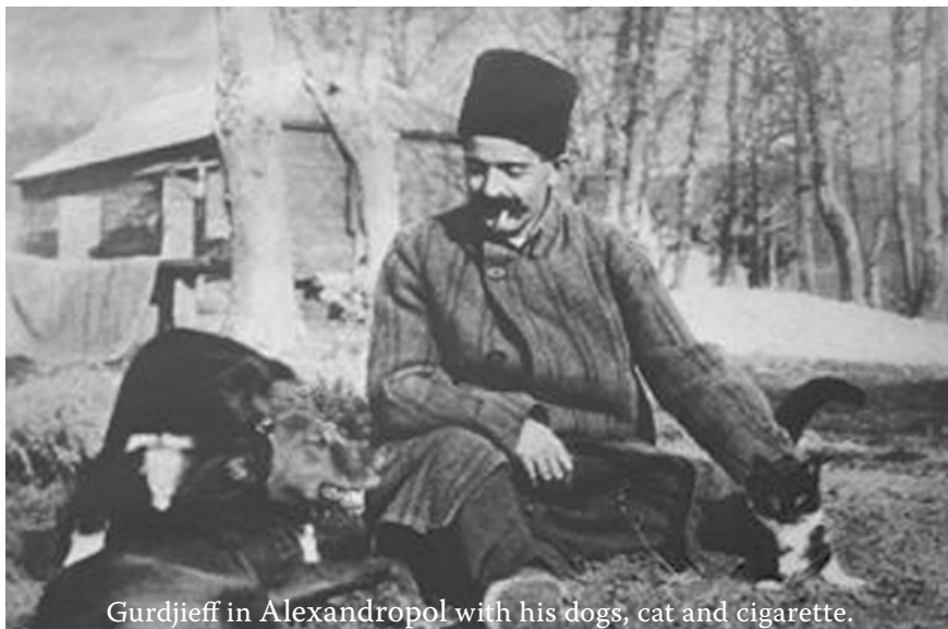
Gurdjieff in Alexandropol with his dogs, cat and cigarette.

Gurdjieff was born in Alexandropol (now Gyumri, Armenia) and grew up across the border in nearby Kars, in Eastern Turkey. He travelled through nearby Central Asia, Egypt and Rome before teaching in Moscow and St Petersburg in 1913. During the 1917 Bolshevik Revolution he returned to his family home in Alexandropol.