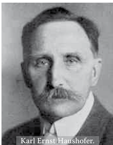
Karl Ernst Haushofer.

While in India, Kitchener made many trips to Tibet, where he met Karl Haushofer, a Freemason, member of the Berlin Golden Dawn, inventor of Lebensraum and father of Albrecht Haushofer who became the Duke of Kent's lover and the father of his son, the second Duke of Kent. Kent is the old name for Egypt, as is 'kempt' and 'Ken'.