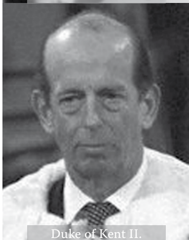
Duke of Kent II.